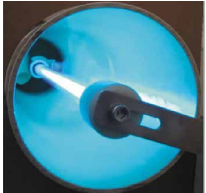
Interior of UV treatment system

In conjunction with Plant & Food Research, we are about to start the construction of a three-dimensional library of blueberry shapes to help with predicting berry motion in a notional treatment device. The second-generation prototype currently under manufacture will let us investigate the detail of fruit motion and better control of UV treatments.